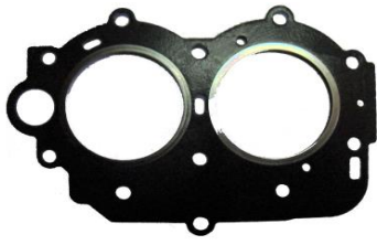
420 305 sandwich klingerit 57,2 Ø